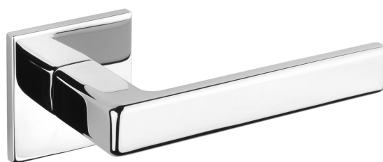
Finish Photographed: Polished Chrome (PC)