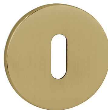
Finish Photographed: Raw Brass (RB)