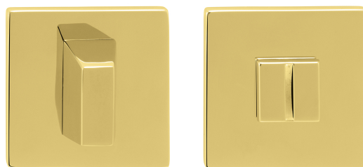
Finish Photographed: Raw Brass (RB)